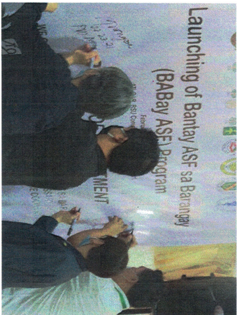
Commitment signing for the Launching of Bantay ASF sa Barangay Program (BABay ASF)