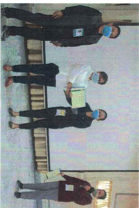
Consistent with the Annual Recognition of performing Sections/Units, certificate of recognition were awarded to CDMSS as the Top Performing Section for CY2020